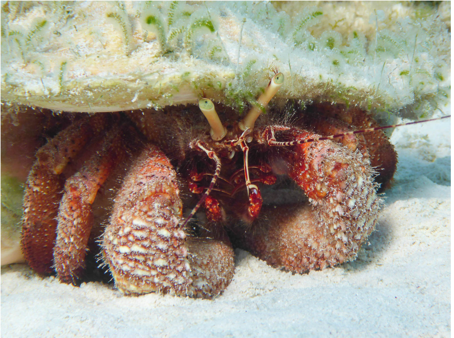
Giant hermit crab carrying a queen conch shell.