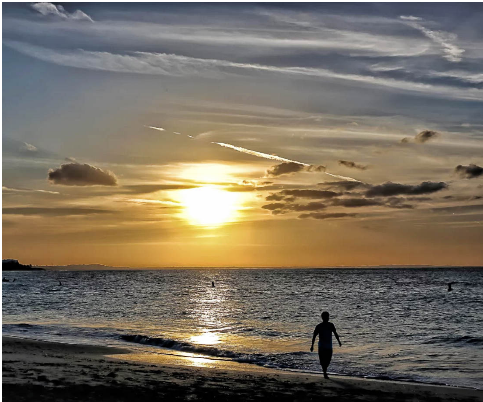
"Beginning sunset over Grace Bay". Providenciales, Turk & Caicos.