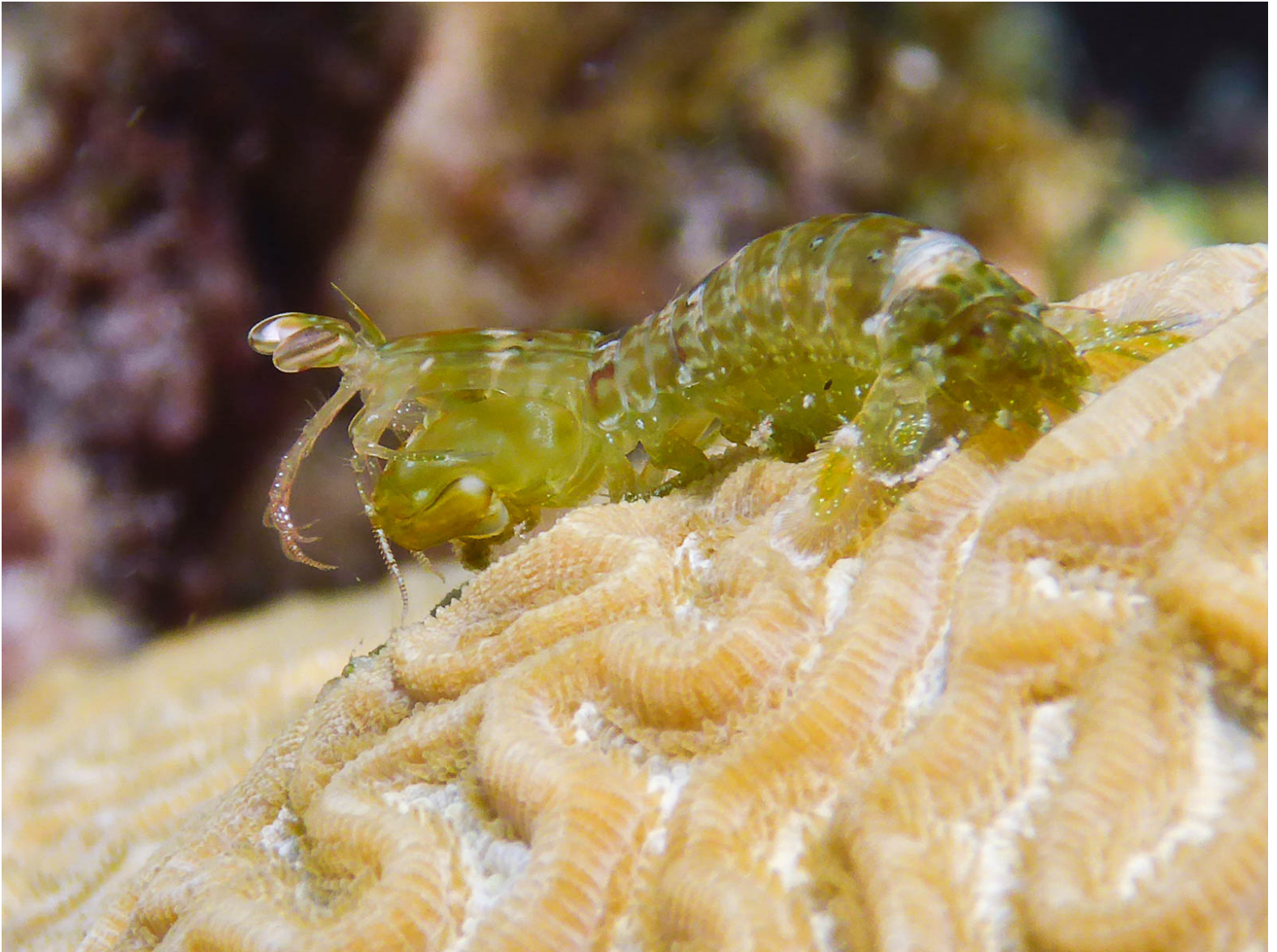
Mantis shrimp profile.