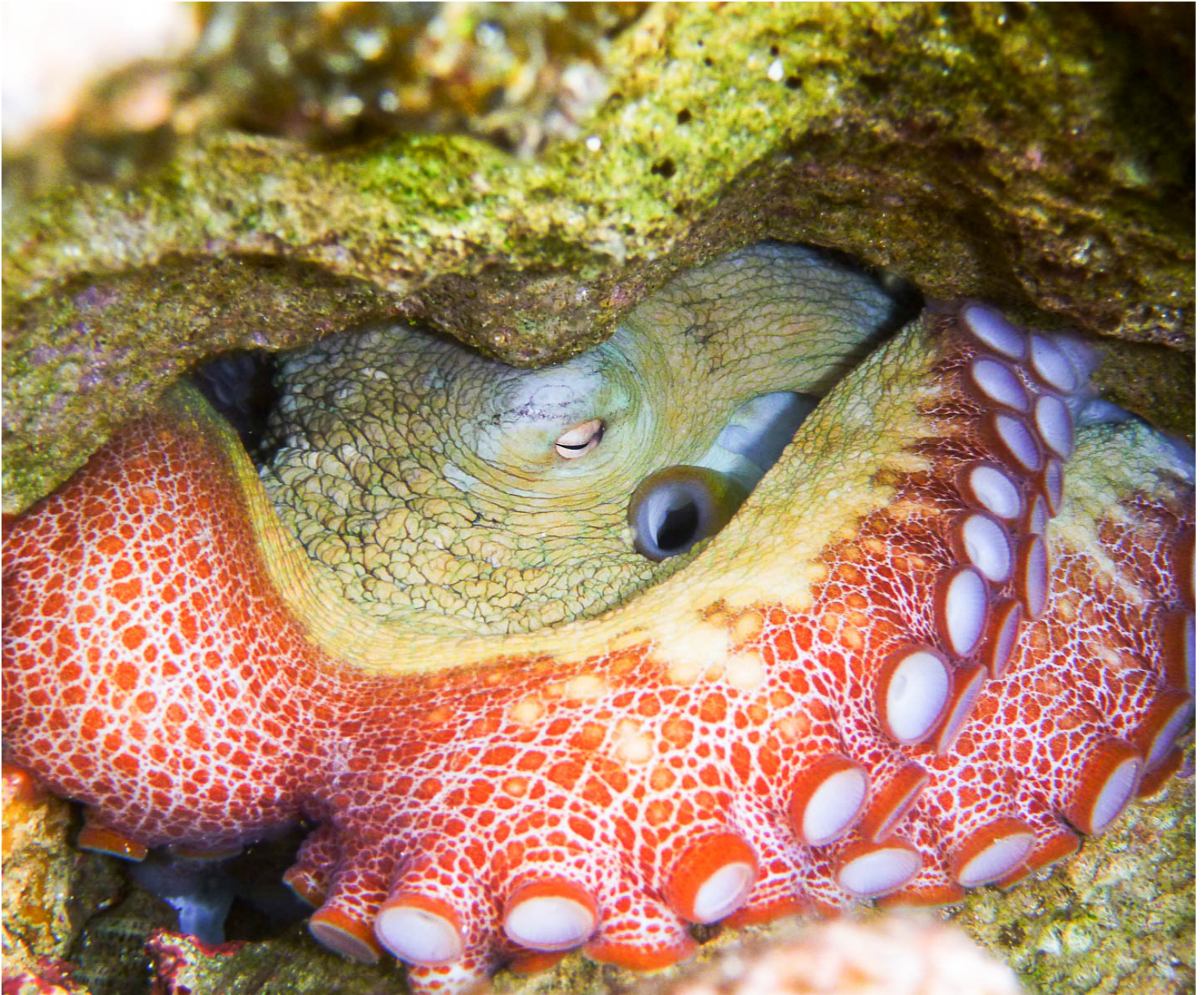
Curvy common octopus.