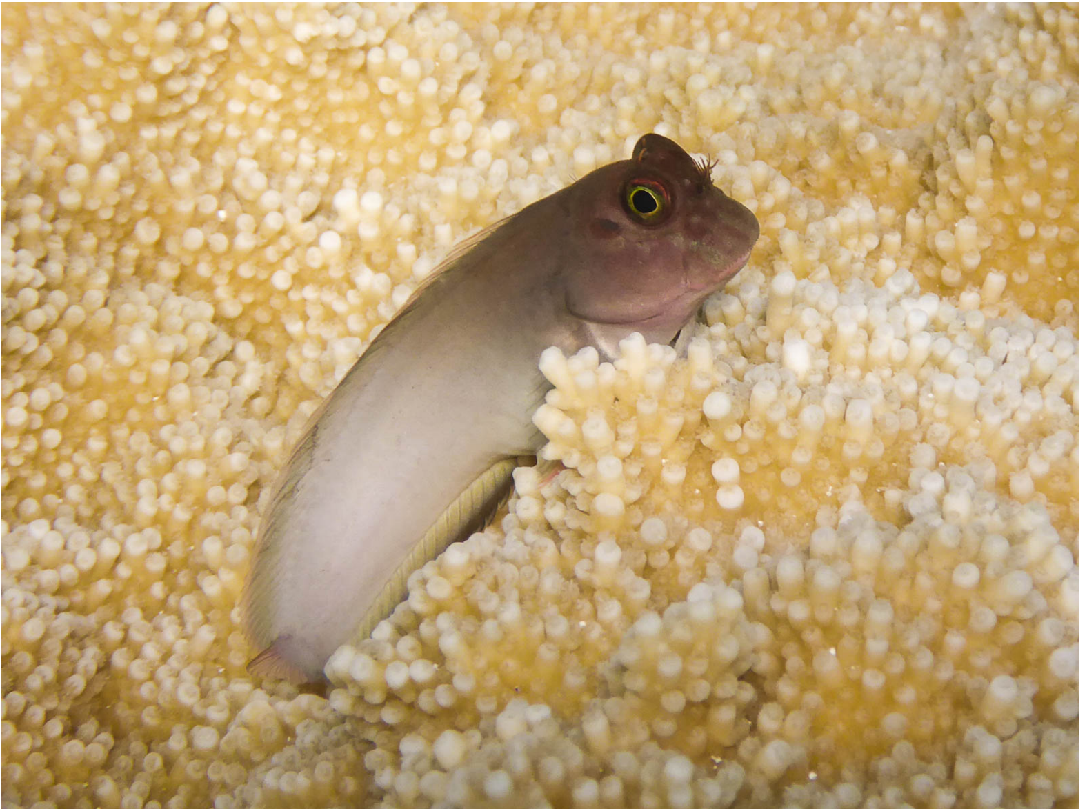
Nuptial redlip blenny gray variation.