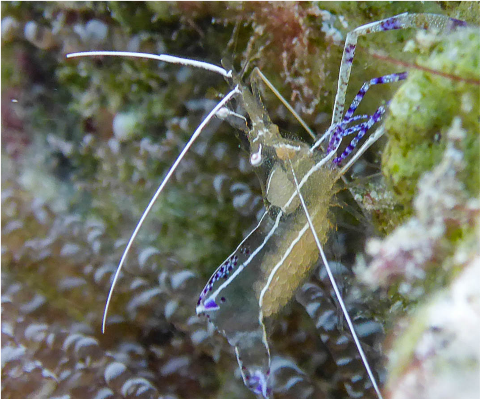
Berried Pederson cleaner shrimp.