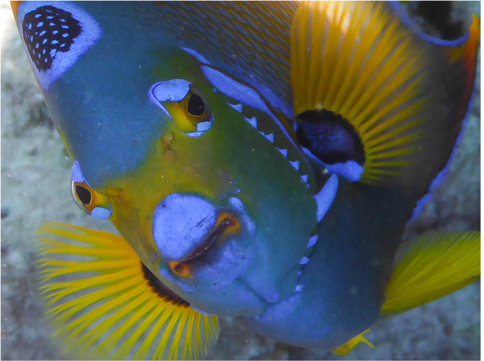
A curious Queen Angelfish.